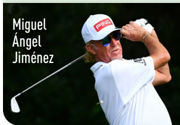
Miguel Ángel Jiménez