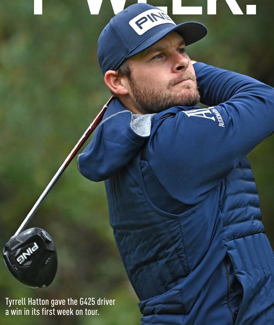
Tyrrell Hatton gave the G425 driver a win in its first week on tour.

R elying on a new G425 driver, 3-wood and 7-wood that went into the bag last week, Tyrrell Hatton made good use of the PING technology, winning the European Tour's flagship event, the BMW PGA Championship, by four strokes at Wentworth Golf Club in his native England. Hatton achieved two career goals in claiming his fifth European Tour title: cracking the top 10 in the Official World Golf Ranking (he's 10 th ), and winning a tournament he's long coveted.